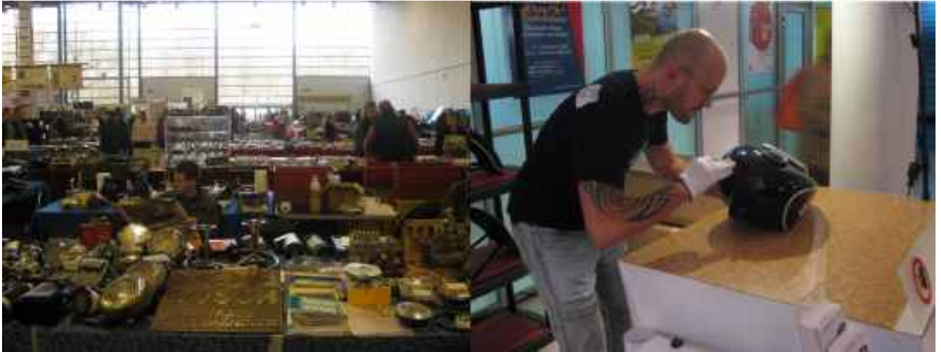
Left – A view across some of the autojumble stalls. Right – A demonstration of hand lining a petrol tank.