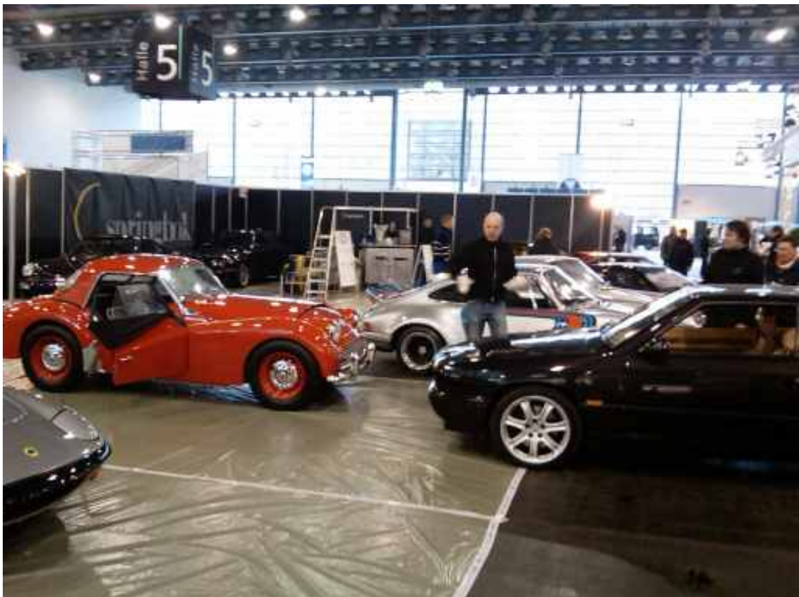
Fitting them all in into their slots with typical German precision & efficiency!