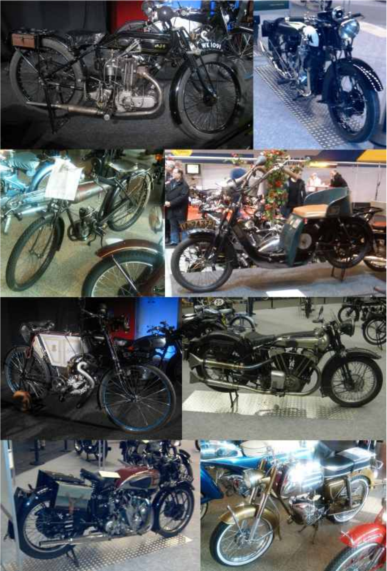
And some great classic motorcycles aswell.