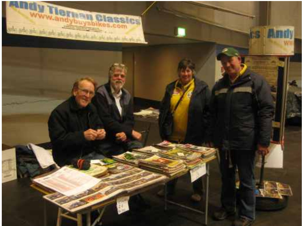
The neighbours say hello. They are the rolling road starter people.