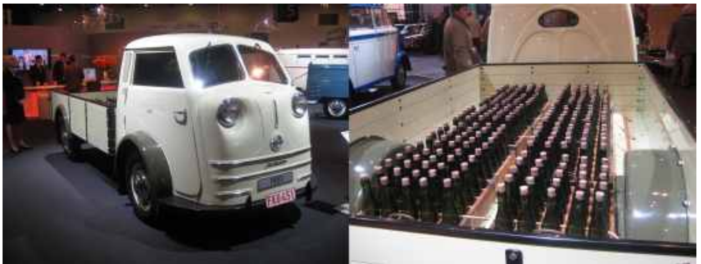
A German delivery lorry complete with cargo.