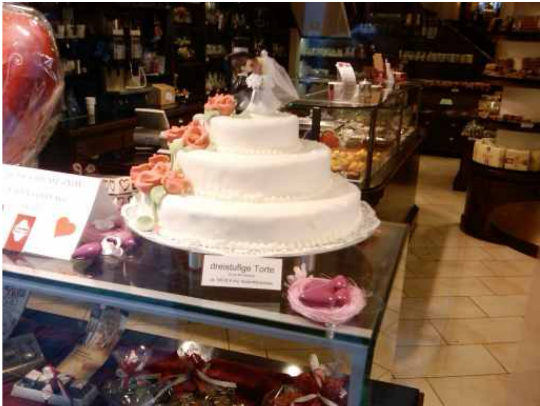
This wonderful wedding cake in a cake shop in Bremen is supposed to feed 64 people; rather less if the man from me is at the wedding!