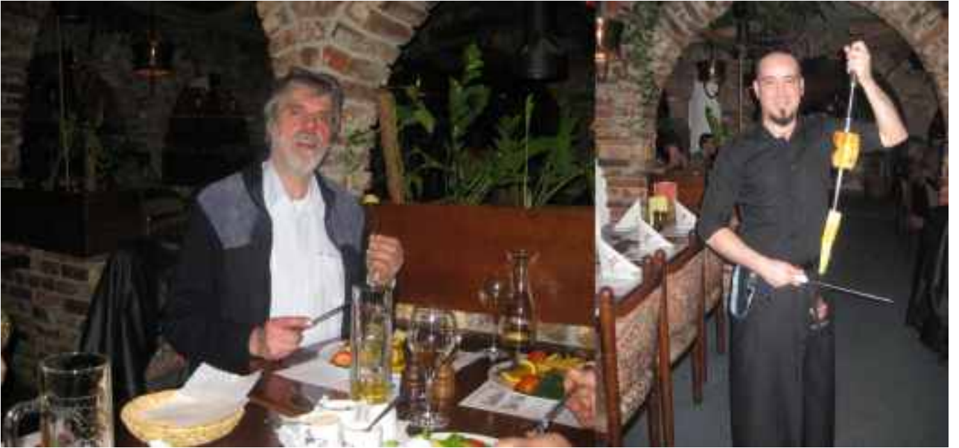
An evening meal in a local kebab restaurant