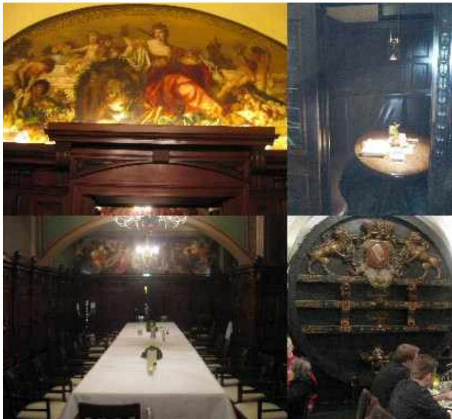
More photographs taken inside the Rathaus