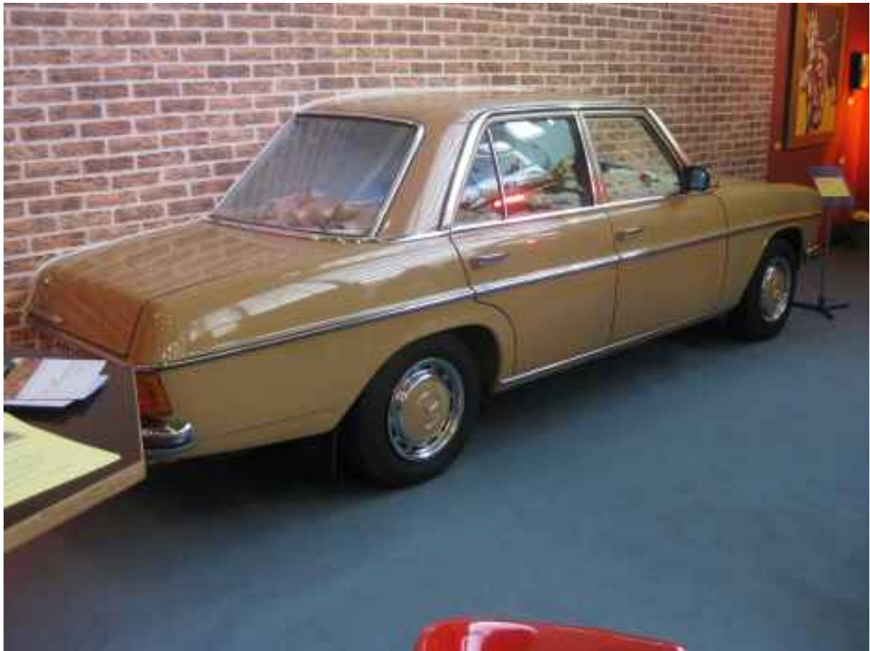
An interesting display. Perhaps the moral here is don't park on a building site