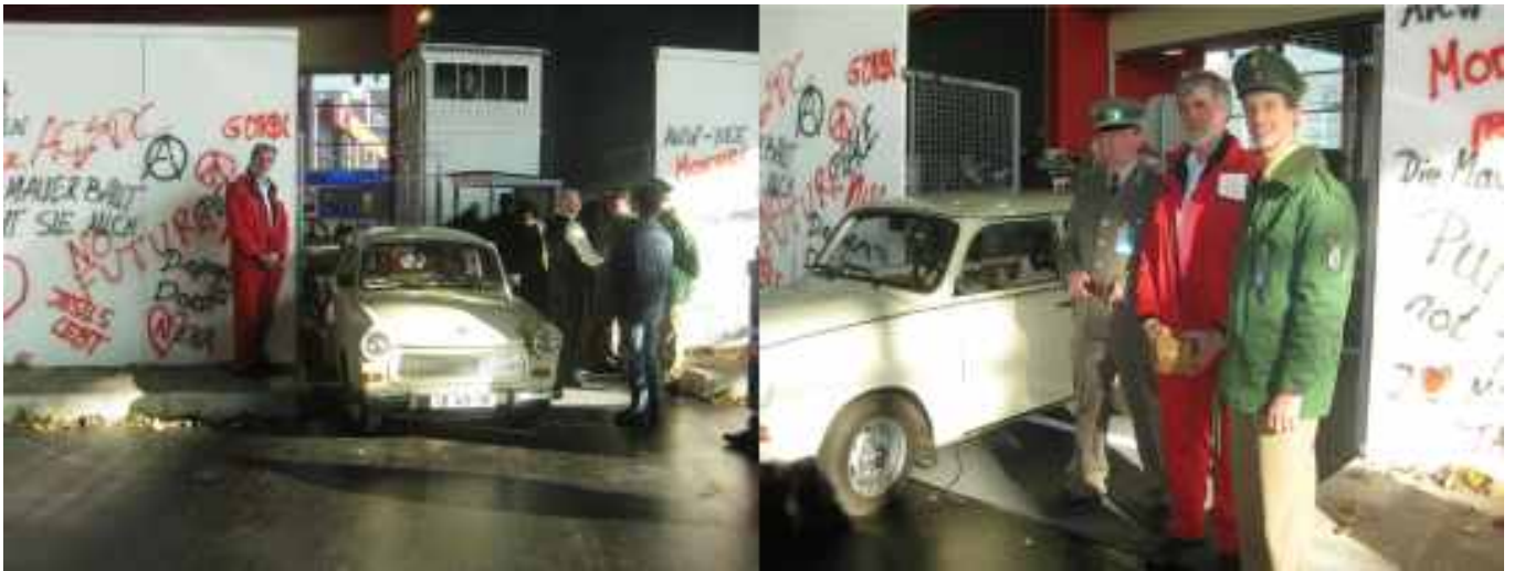
Left - A mock up of a cold war Berlin Wall border crossing checkpoint. Right - Andy with East & West German border guards; can you see which is which?