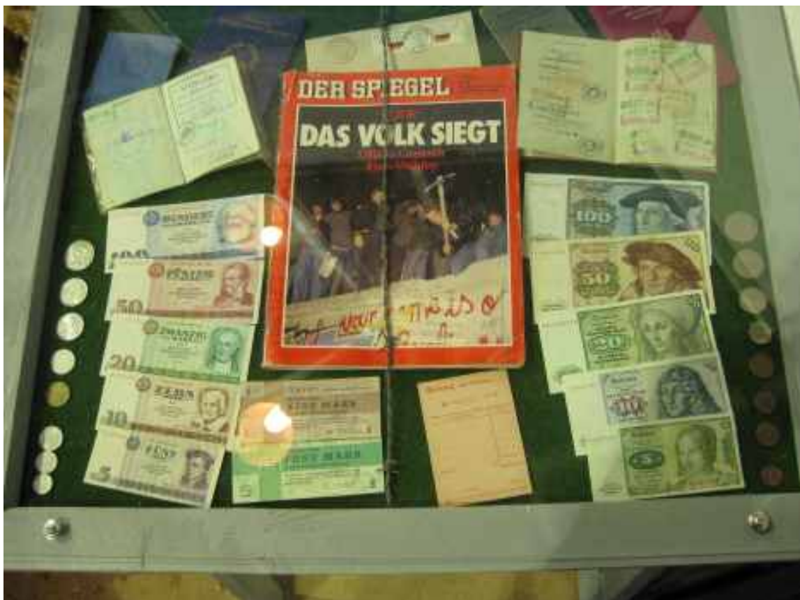
Another reminder of the old East & West German. Documents & money on display.