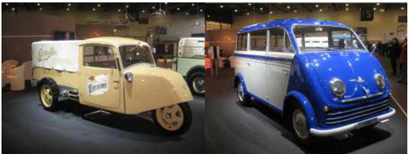
Left – A German 3 wheel truck. Right – A German minibus.