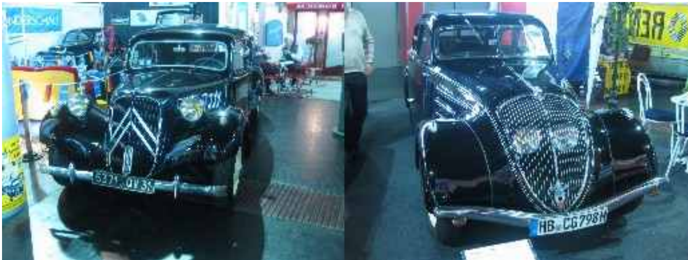
Two typically French cars from the 1930's. Left – A Citroen. Right A Peugeot.