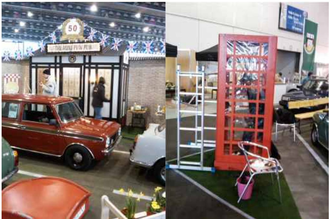
The show had a British theme, hence the Mini fun pub with the telephone box roof outside. Where is the rest of the telephone box? Oh there it is, perhaps the roof is too heavy to go on top?