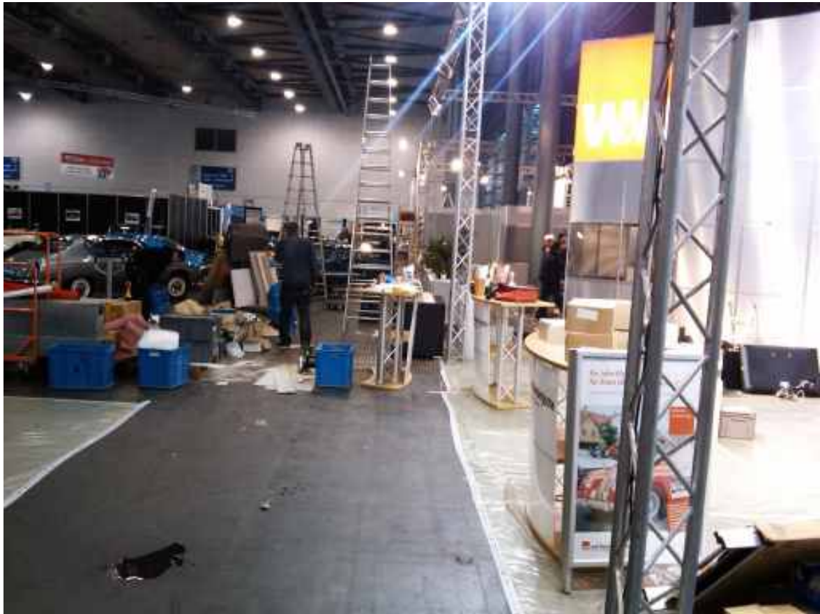
Health & safety German style during set up. Fancy working up one of those step ladders while people are moving vehicles and stalls around underneath?