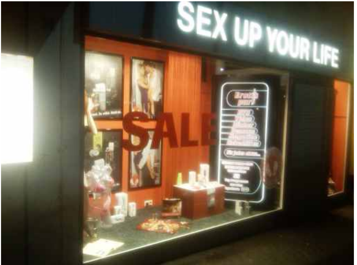
Bremen night life, & oh look there's a sale on.