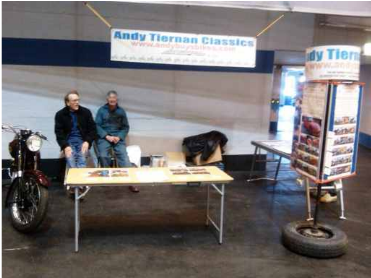
Back at the show the boys are ready for the day's action.