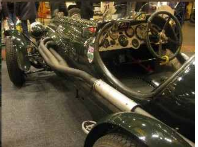
A small selection of some of the wonderful automobiles on display.