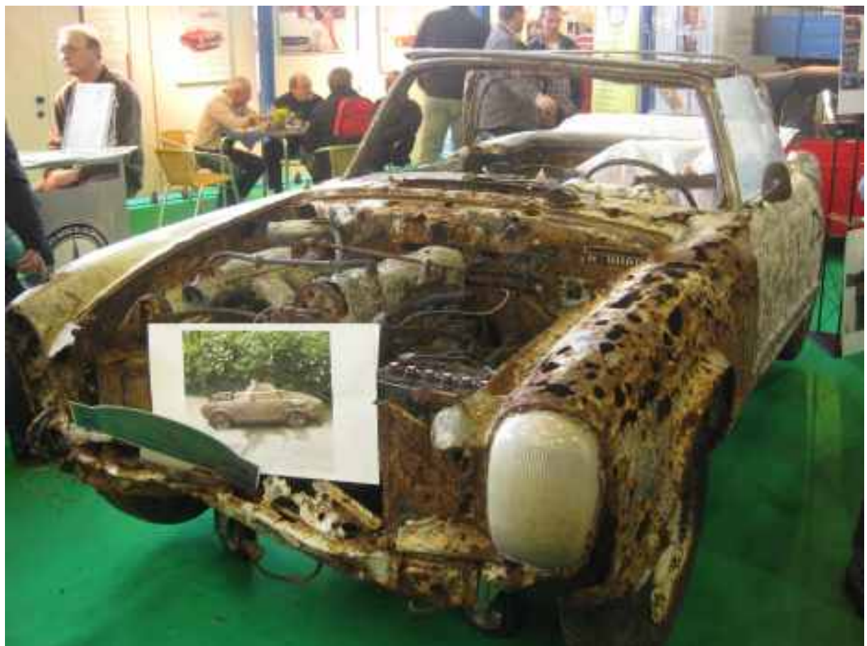
Ripe with rust for restoration!