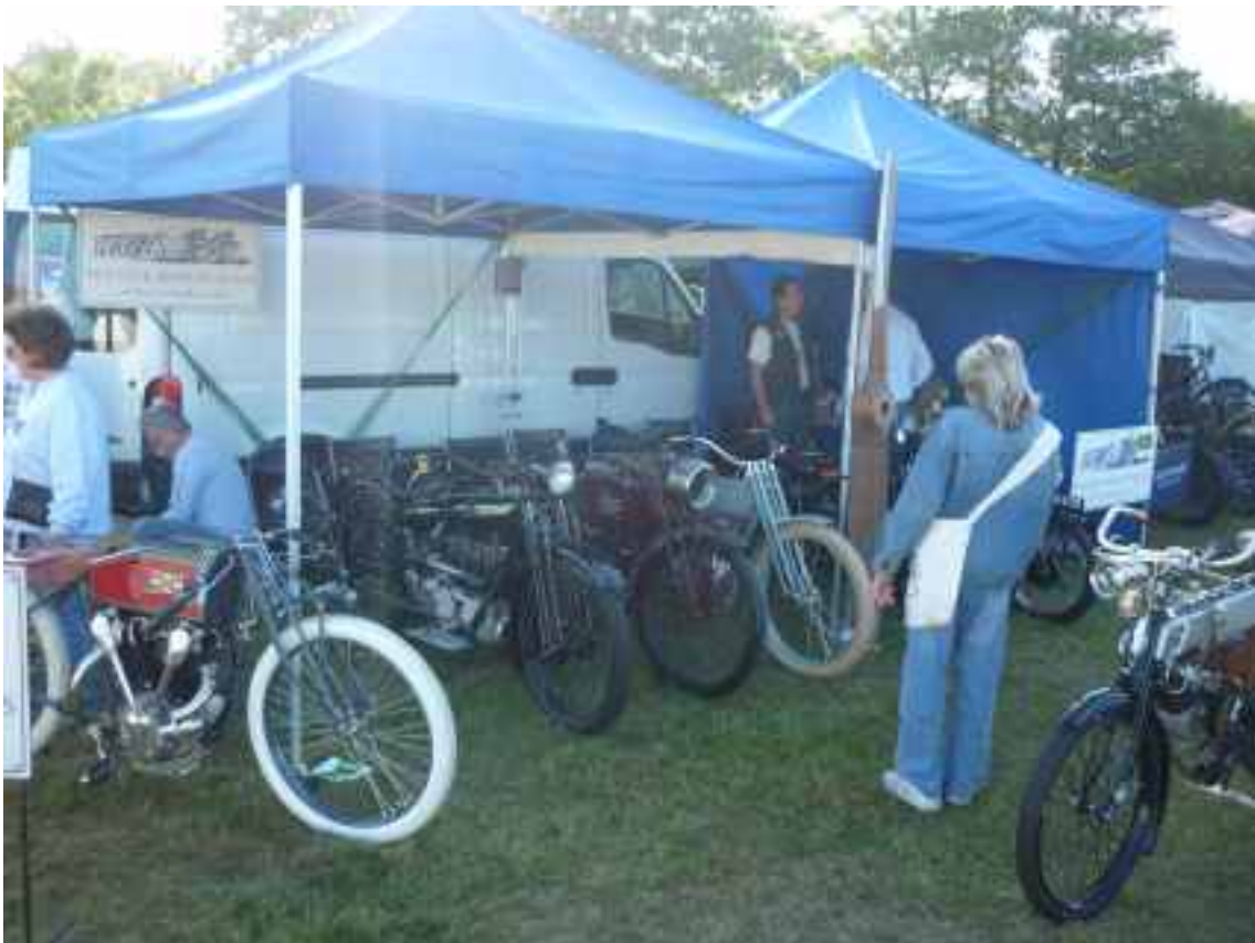
A fair Saturday morning & 'Yesterday's Motorcycles' stall displaying some fine early American machinery.