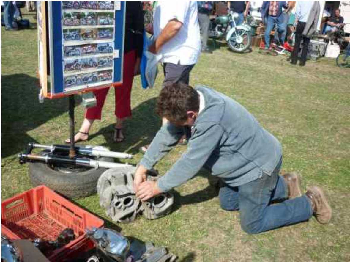
Finally it looks like someone is going to buy the Laverda triple crankcases, & they did.