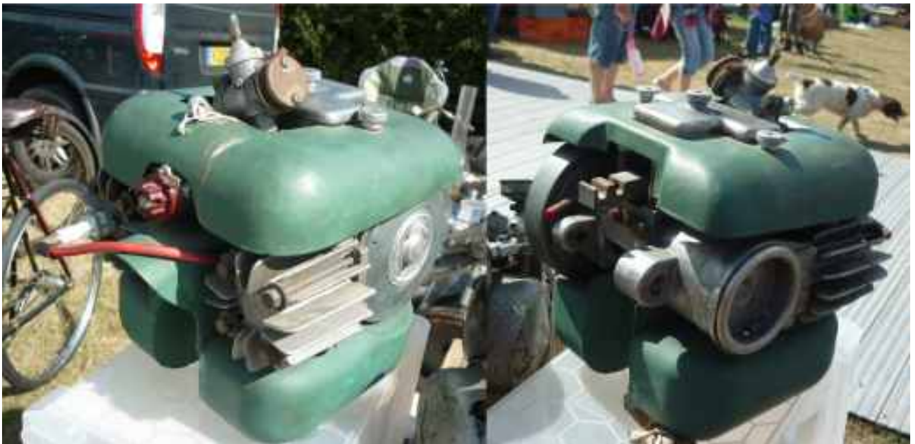
Meanwhile back in one of the autojumble fields this little gem was spotted. It is an extremely rare cyclomotor called a 'Baby Star'. It is a single cylinder & not as some people thought a twin. Although it appears to have two finned cylinders, upon closer inspection there was only one with a spark plug in the top, the other side probably being a finned exhaust.