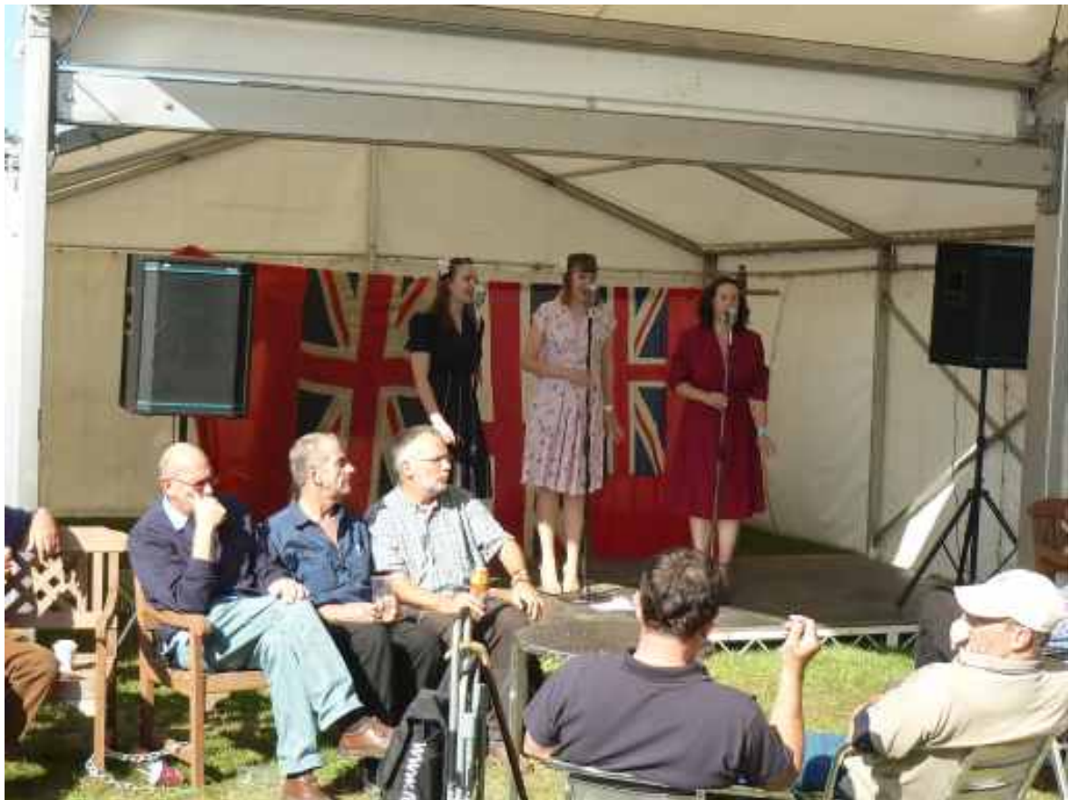
To add to the atmosphere there was some good entertainment laid on.