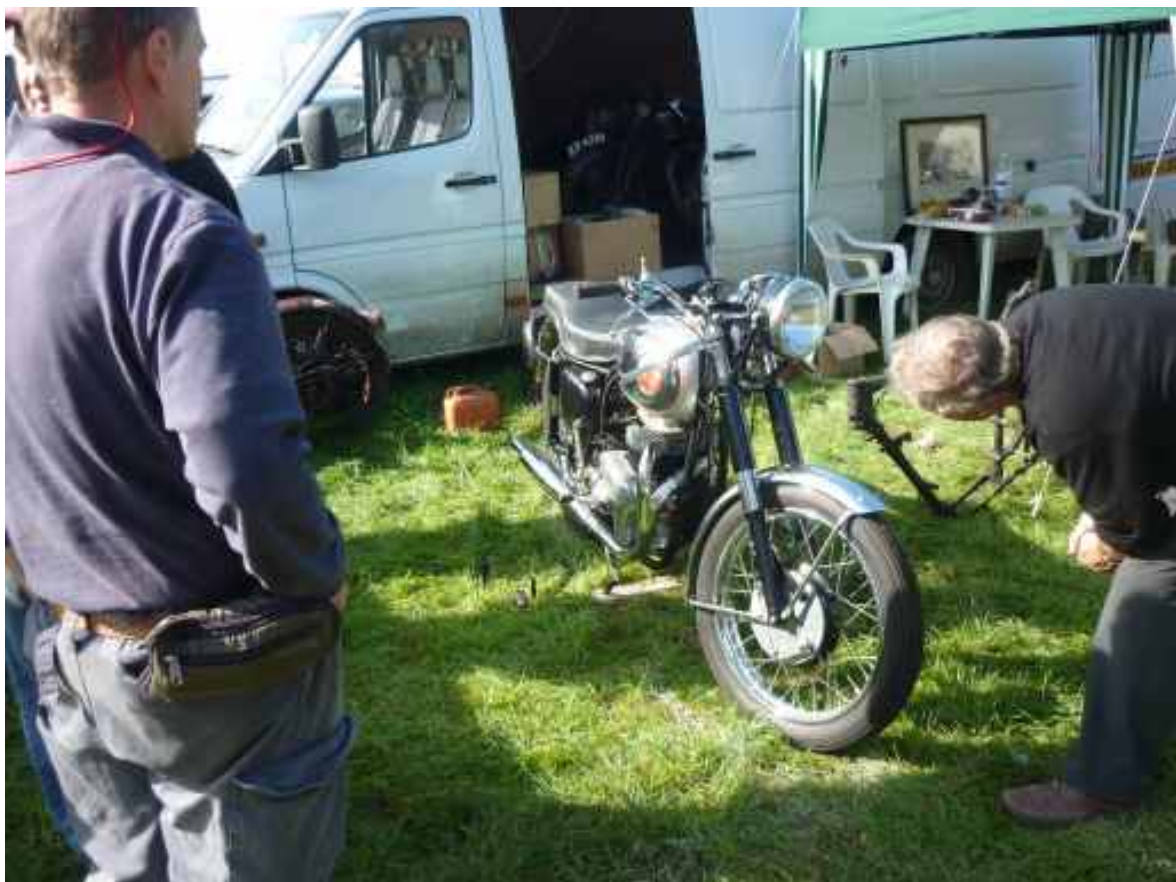
A BSA A7 500 masquerading as an R.G.S., complete with touring & racing handlebars.