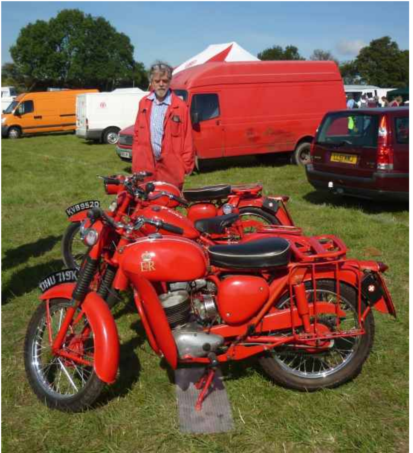
Talk about seeing red! Well three Post Office telegram delivery bikes actually. All BSA Bantams from different years. Even the van in the background has come out in sympathy.