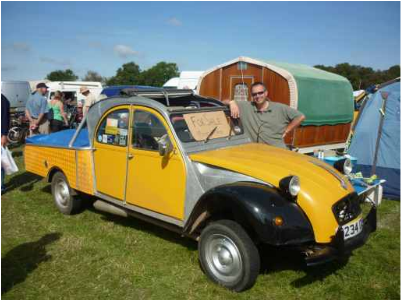
Now here's an interesting conversion, a Citroen pickup truck, with owner!