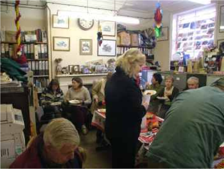
Grub up, tuck in everyone!