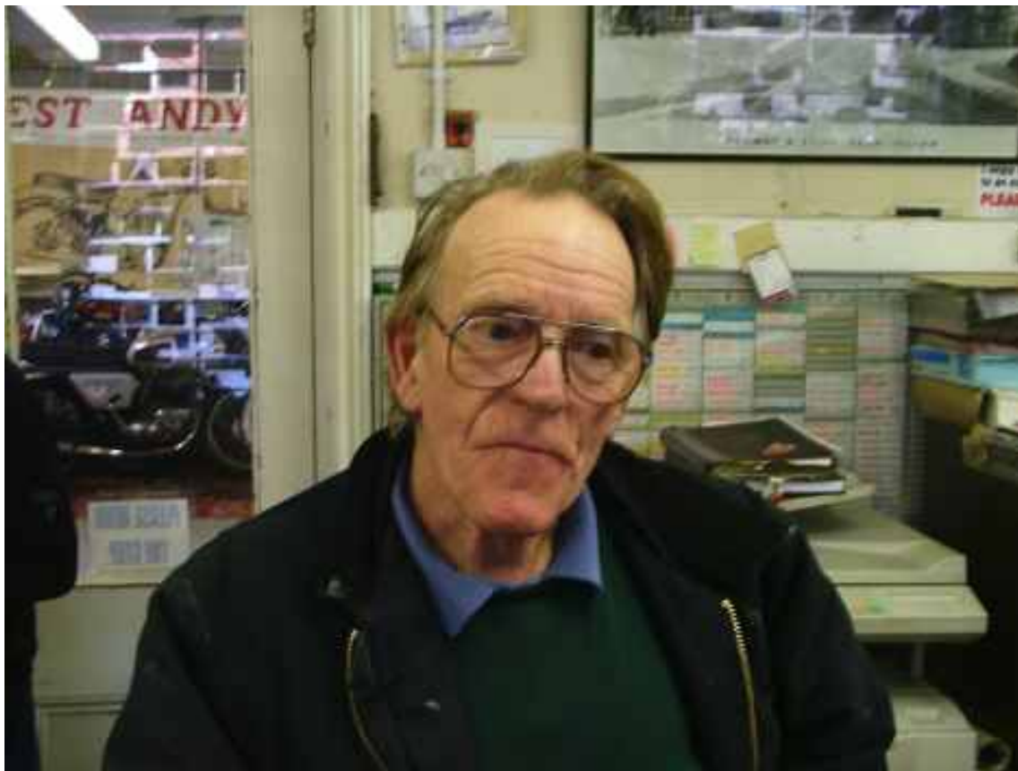
Ginger. Possibly in a confused state of mind?